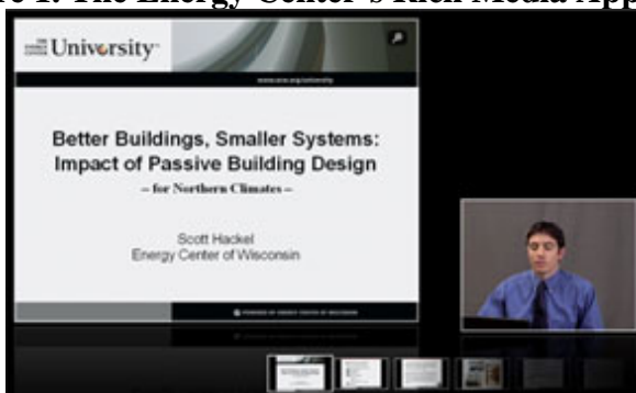
Figure 1. The Energy Center's Rich Media Approach

With the advent of new technology offering rich media (the combination of PowerPoint and video streamed together), we recognized the potential impact of delivering courses in this format. Energy Center University had already earned a reputation for providing high quality classroom training. Customers were now demanding online education that mirrored our classroom approach, and rich media allowed us to meet that need by combining technical content delivered by excellent speakers through an accessible, user-friendly interface (Figure 1). We realized that using rich media to display the presenter as well as the presentation was key to fully engaging our online audience.